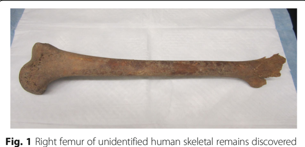
Fig. 1 Right femur of unidentified human skeletal remains discovered in 2012 in Deadwood's Presidential District

The right femur was provided to the IAG for DNA testing (Loan Accession No. 12–0051, South Dakota Archaeological Research Center) (Fig. 1). A portion of the